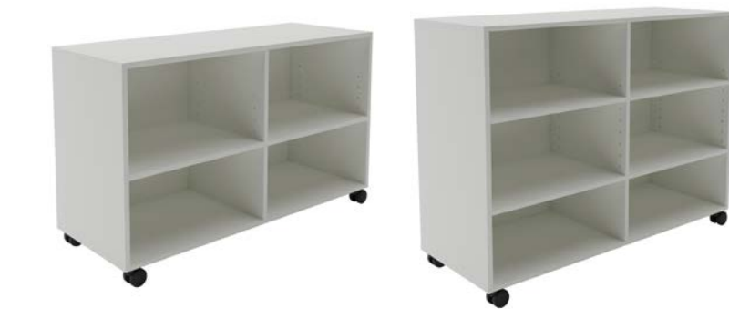
Smart Straight Smart Bookcase 720mm Straight Bookcase 900mm