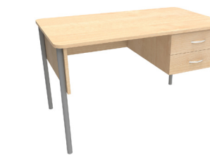
Affinity Maple Single drawers