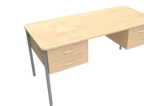
Affinity Maple Double drawers