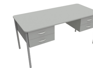
Seal Grey Double drawers