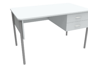
Snowdrift Single drawers