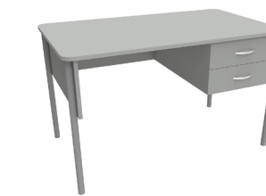
Seal Grey Single drawers