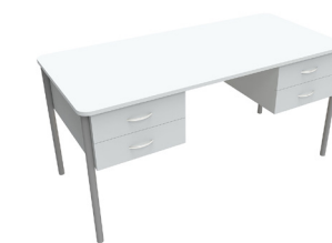
Snowdrift Double drawers