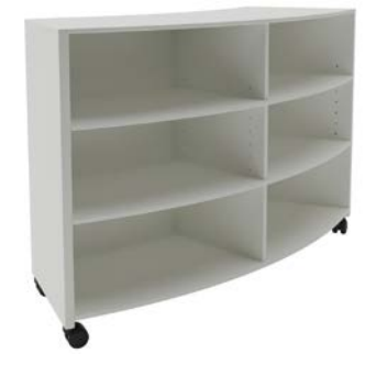
Smart Curved Bookcase 900mm