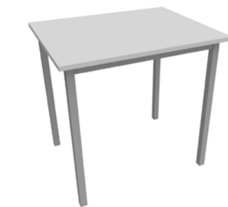
Mid Grey 750x600