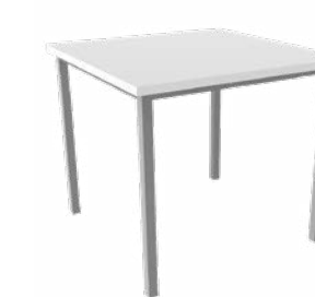
Cloud White 600x600