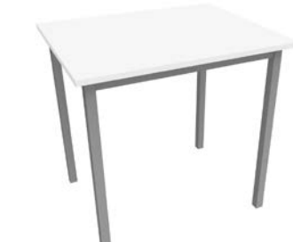
Cloud White 750x600