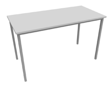
Mid Grey 1200x600