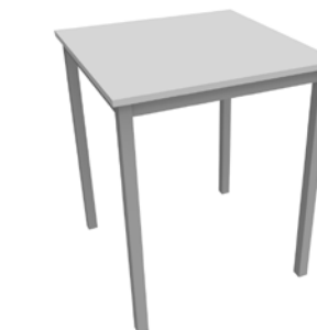
Mid Grey 600x600