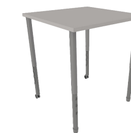
Mid Grey 600x600