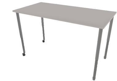
Mid Grey 1200x600