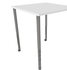
Cloud White 600x600