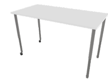
Cloud White 1200x600